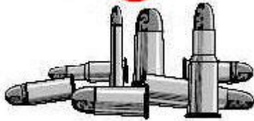
Ammunition not readily available

(This list is updated frequently due to changing availability)